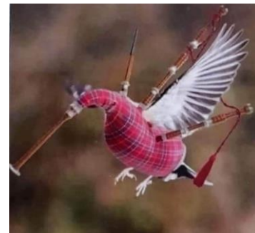
Photograph of the incredibly rare Scott's Hummingbird