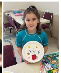
a budding artist