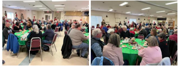
Christmas Festive Dinner luncheon - Full House!

The other was a Christmas Festive Dinner held on Dec. 6 serving over 130 delicious turkey dinners with all the trimmings and great entertainment by the Canadian Showtime Chorus, PB'n'J Quartet enhancing the Holiday spirit with their harmonizing songs.