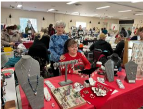
One of many vendors

Since the November CONTACT Newsletter Ladies' Auxiliary report, the Ladies' Auxiliary held two very successful fundraisers. One was a Holiday Vendor Extravaganza Sale on Saturday, November 26th featuring 30 vendors, a L.A. baked goods table and a L.A. crafts table.