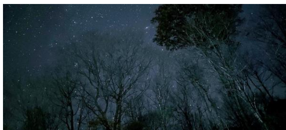
The Night Sky, Dagny Greby