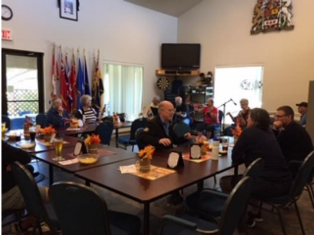
Saturday, September 24. Musicians from left to right:

Saturday afternoon in the lounge announces live music. A good time was had by all. Note the lounge is open every Saturday from noon until 4:00 pm to drop in and say hello and make some new friends. There is always a special on tap as well as free popcorn.