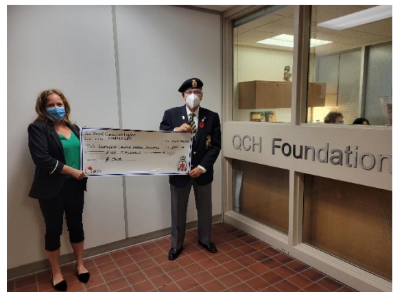
$5000 cheque presented to the Queensway Carleton Hospital Foundation from our Branch Poppy Trust on August 4.