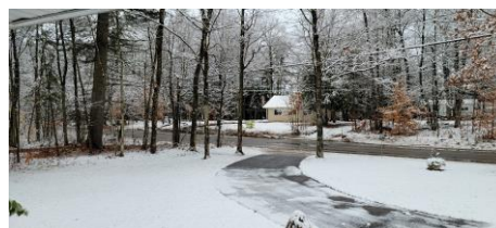
Winter Scene

Please note that we will be strictly adhering to COVID-19 protocols and ask shoppers to bring their own bags.