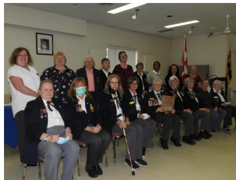
Honours and Awards 30 th Anniversary