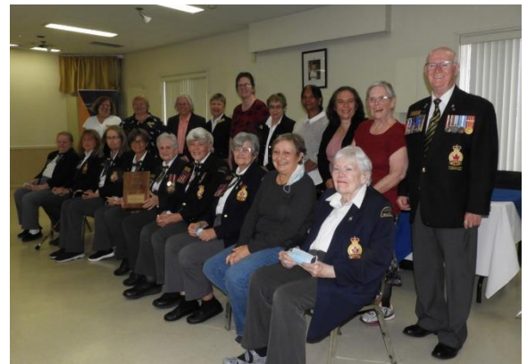
L.A. 30 th Anniversary Plaque from Branch