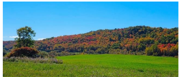
Fall Scene