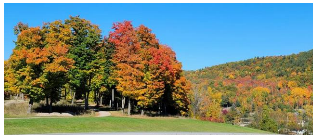
Fall Scene